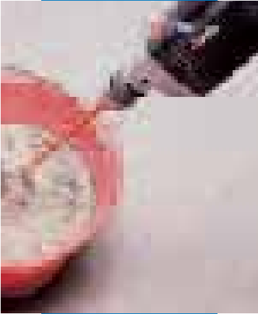
Mixing Adesilex P4

Adesilex P4 should be mixed in a clean receptacle with 5-5.5 litres of clean water for