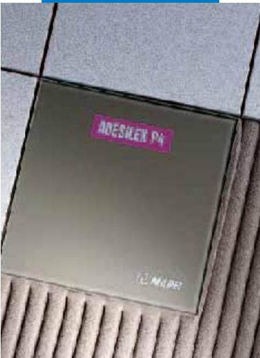
Comparison of back-wetting between a normal adhesive and Adesilex P4