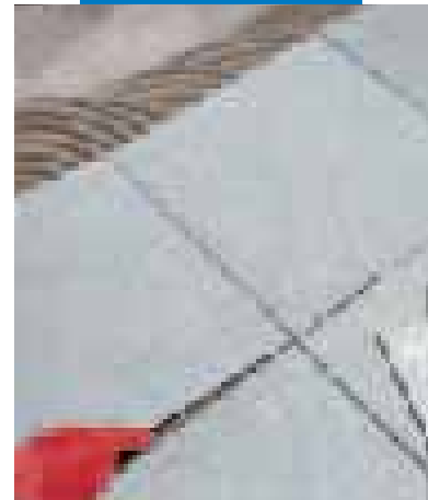
Laying porcelain tiles