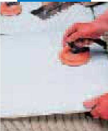
Laying large size tiles