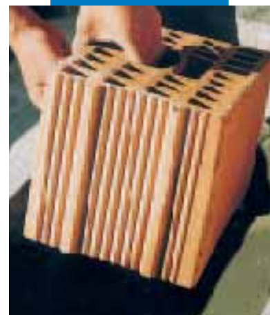
Dipping a concrete block in Adesilex P4