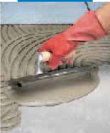
Spreading with semicircular notched trowel