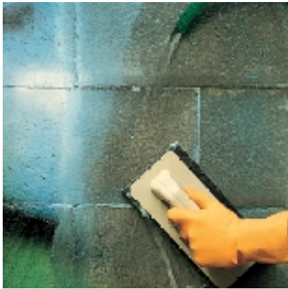
Cleaning with an abrasive pad

Apply WallGard GRAFFITI REMOVER GEL with a brush onto the graffiti or drawing. Let stand 5 to 10 minutes and then remove the gel with a high-pressure cleaner.