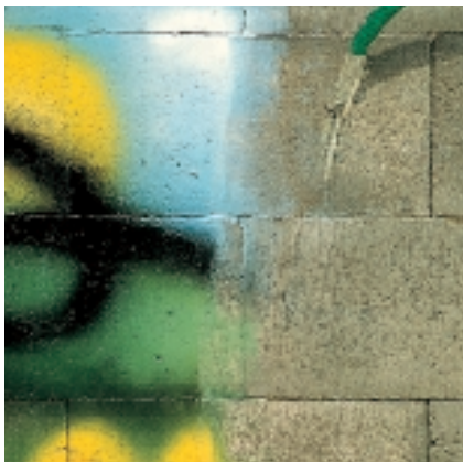
Cleaning with running water