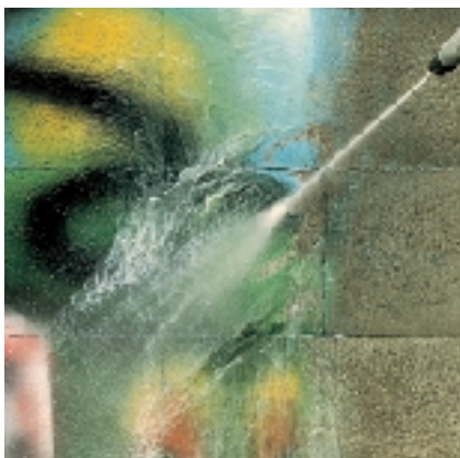
Using a high-pressure cleaner