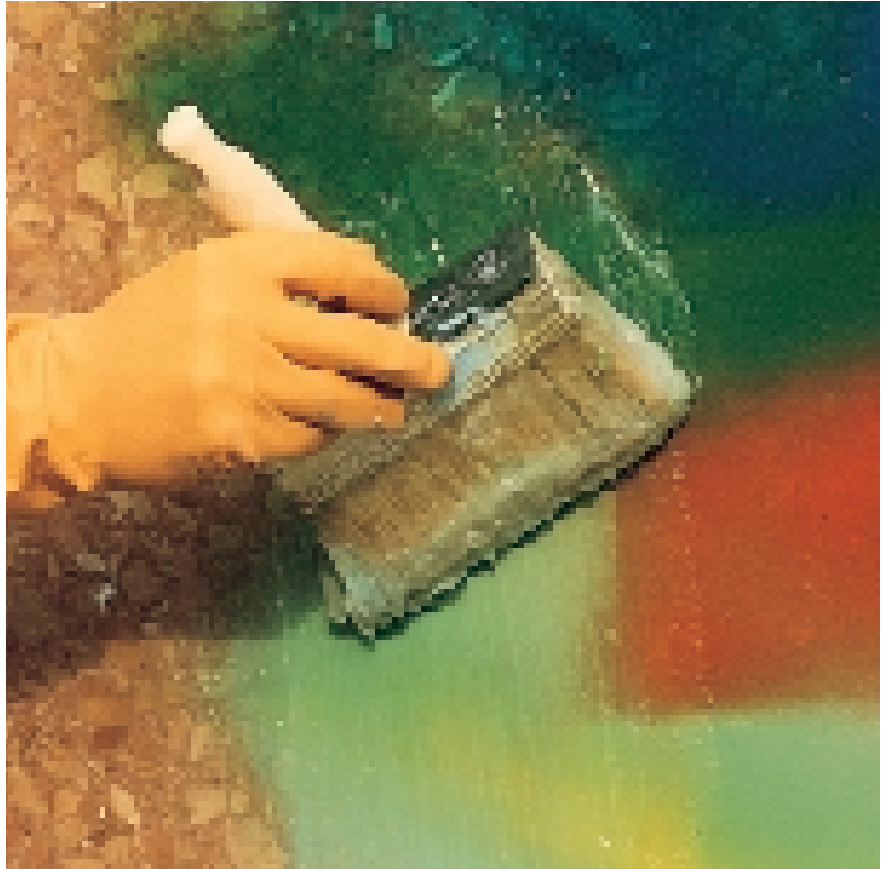
Applying WallGard GRAFFITI REMOVER GEL on natural stone