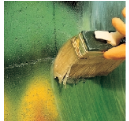
Applying WallGard GRAFFITI REMOVER GEL with a brush