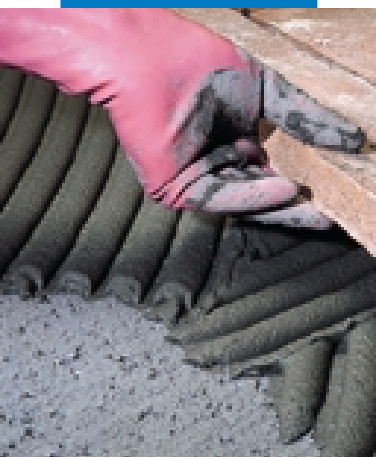
Installation of hand made terracotta on an uneven substrate