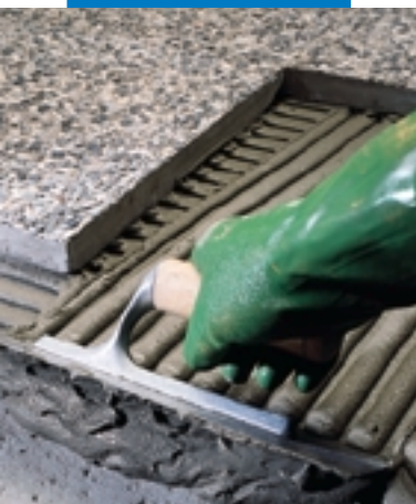
External installation of relief "graniglie"