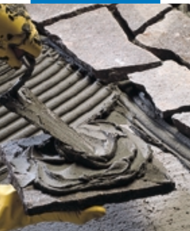
Installation of external hewn back stones with or without buttering, depending on thickness