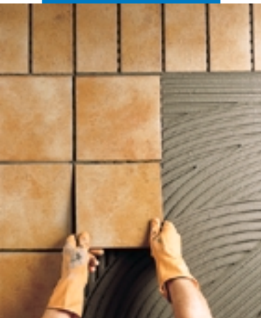
External installation of klinker tiles