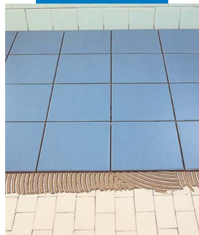
Tile on tile with Keraflex Grey