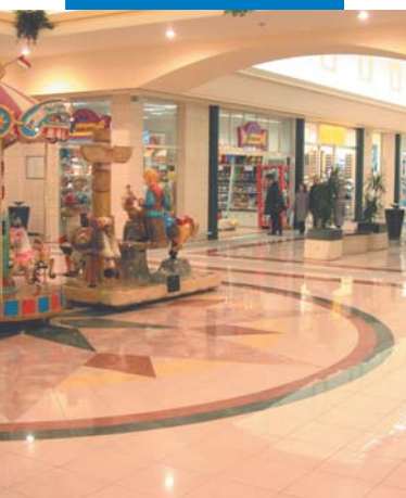
An example of an installation of porcelain tiles - Zanchetta Shopping Centre - Treviso (Italy)