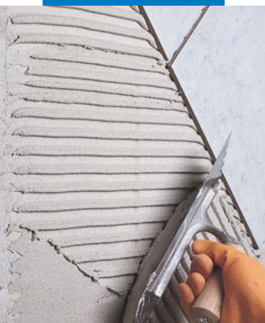
Installation of single-fired tile on expanded foam concrete block walls