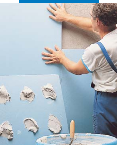
Laying polystyrene foam slabs with Keraflex white