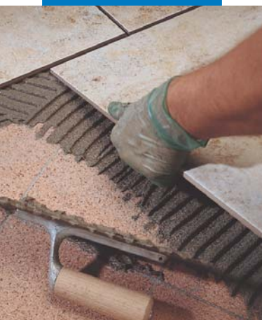
Single-fired tile on terrazzo tile of an external wall