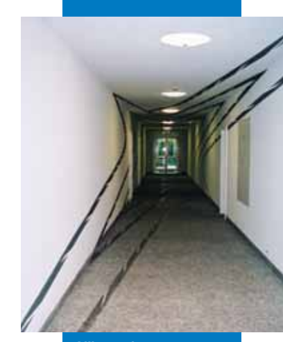
Alliance insurance offices - Munich -Germany