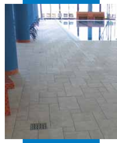
Hotel Radison -Bükkfürdő - Hungary

Temperature resistance after final cure: