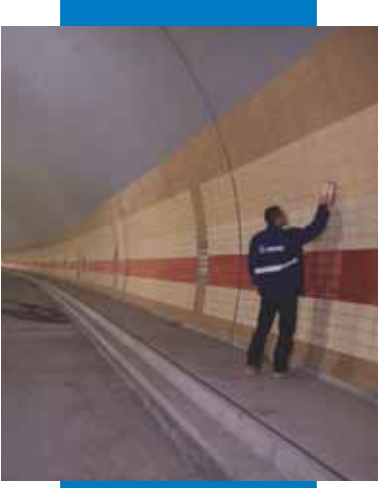
Mrázovka Tunnel -Prague -Czech Republic