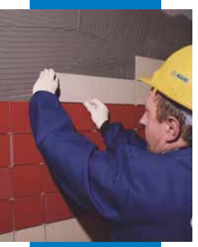
Fixing ceramic tiles on walls working from the top to the bottom