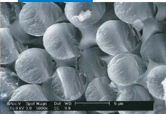
A microscope photograph of a polymeric matrix structural composite from the Mapei R&D Laboratories

All relevant references of the product are available upon request.