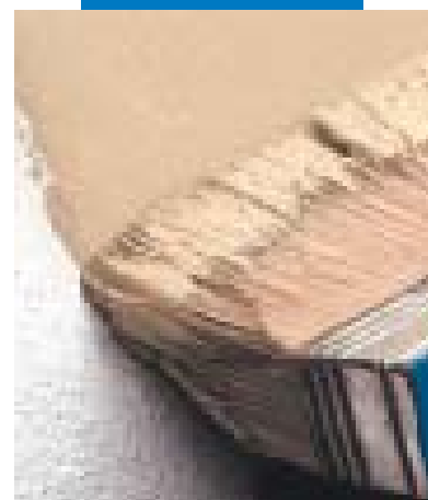
Coating with Elastocolor