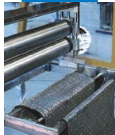
Impregnating Mapewrap C with a machine