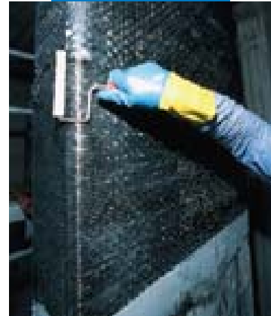
Applying a second coat of Mapewrap 31

N.B. - Although the technical details and recommendations contained in this product report correspond to the best of our knowledge and experience, all the above information must, in every case, be taken as merely indicative and subject to confirmation after long-term practical applications: for this reason, anyone who intends to use the product must ensure beforehand that it is suitable for the envisaged application: in every case, the user alone is fully responsible for any consequences deriving from the use of the product.