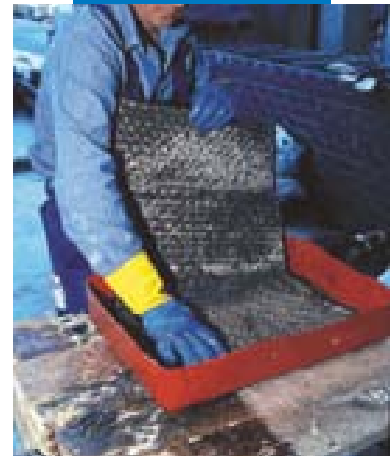
Manually impregnating Mapewrap C