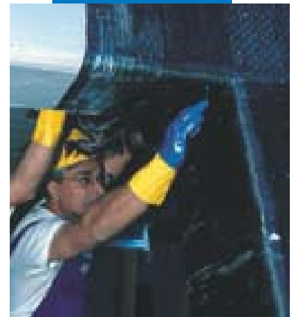
Wrapping a hitch