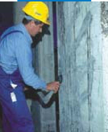
Preparing the substrate