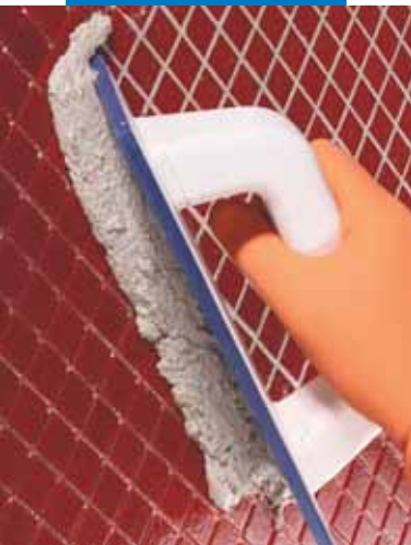
Application of Kerapoxy Design with a hard rubber grout float