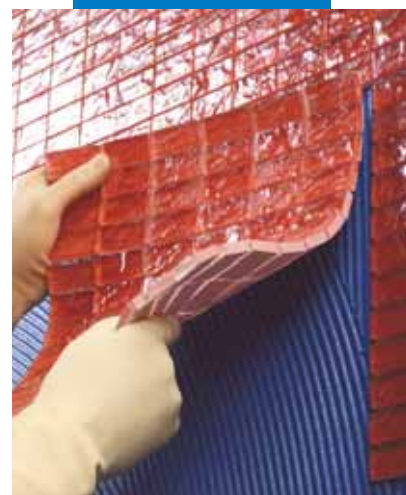
Laying glass mosaic with Kerapoxy Design on wall