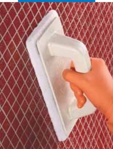
Cleaning off the glass mosaic with a damp Scotch Brite® pad