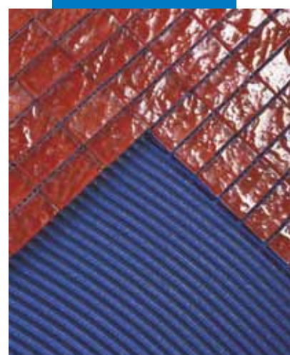
The following day, grouting with Kerapoxy Design in the same colour and the same application procedure previously shown