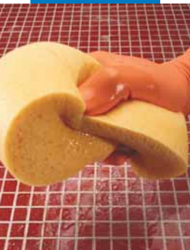
Wetting the surface of the grout before cleaning