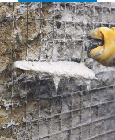
Application of Mape-Antique Rinzafo on weak masonry