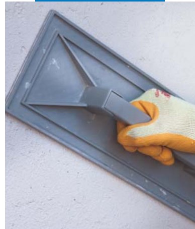
Levelling off the render