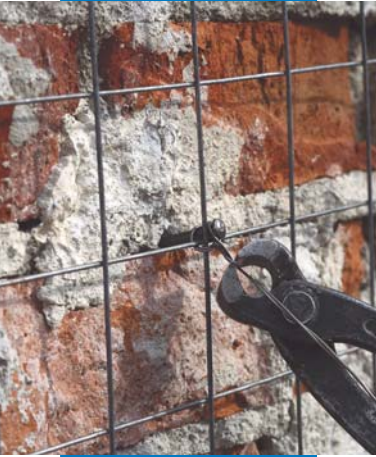
Fastening zinc-plated mesh to the masonry