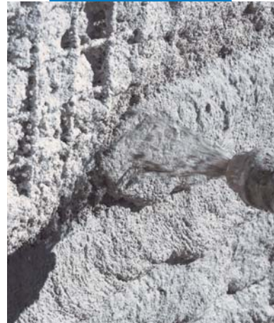
Application of Mape-Antique Strutturale NHL