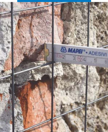
Checking the gap between the mesh and substrate