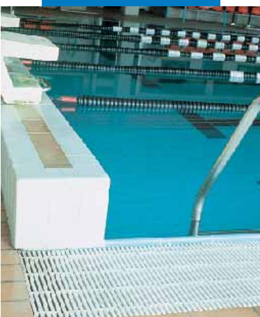
An example of an installation of mosaics with Keracrete + Keracrete Powder in a swimming pool