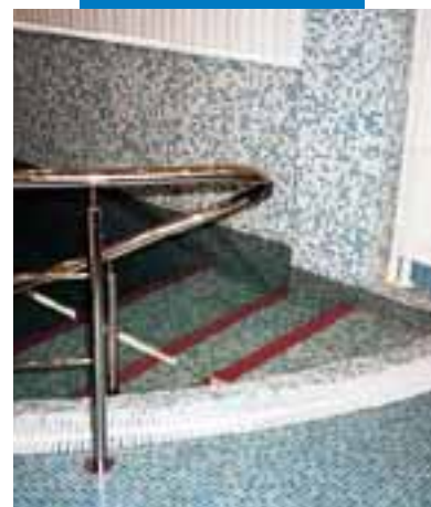
Laying glass mosaics