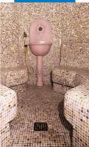
An example of an installation a glass mosaics in a turkish bath - Park Hotel Gritti - Bardolino (Verona), Italy