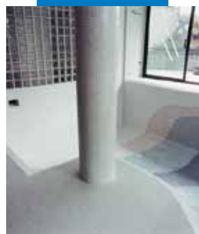
Installation of mosaics