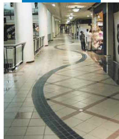
An example of an installation of ceramic tile in a mall - Fillinvest Festival Superhall - Manila (Philippines)