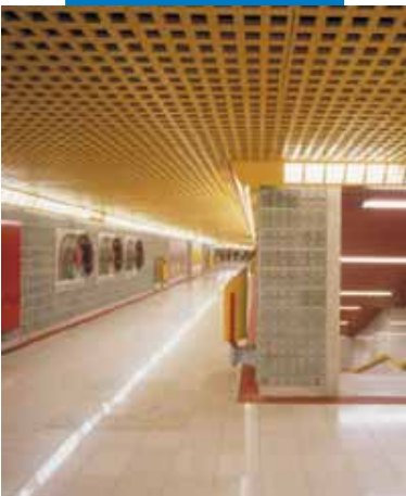
An example of an installation of Granitello in underground - Linea 3 - Milan (Italy)