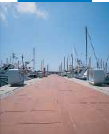
New harbor in Civitavecchia: outdoor installation of terracotta with Keracrete