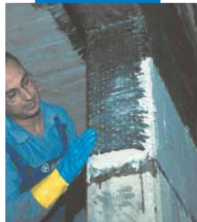
Wrapping columns and beams