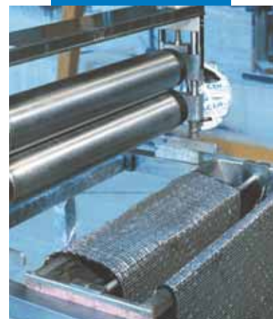
Impregnating Mapewrap C with a machine