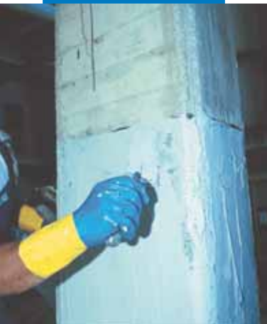
Smoothing with MapeWrap 11 or MapeWrap 12