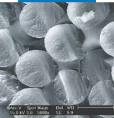
A microscope photograph of a polymeric matrix structural composite from the Mapei R&D Laboratories

All relevant references for the product are available upon request and from www.mapei.com