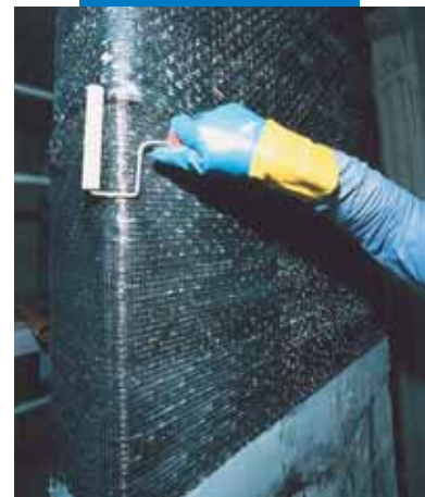
Applying a second coat of Mapewrap 31