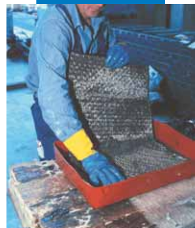
Manually impregnating Mapewrap C