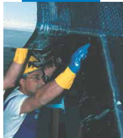
Wrapping a hitch