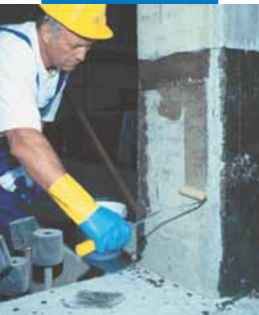
Applying MapeWrap Primer 1