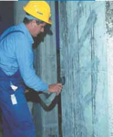
Preparing the substrate