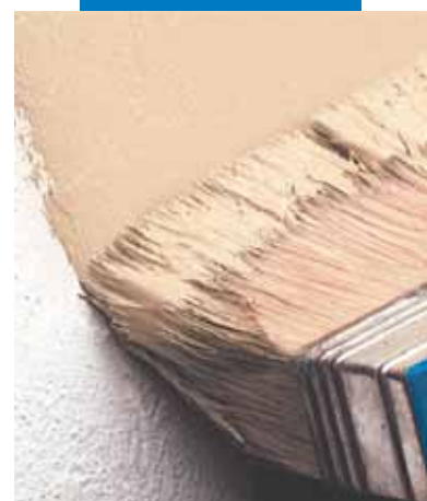
Coating with Elastocolor