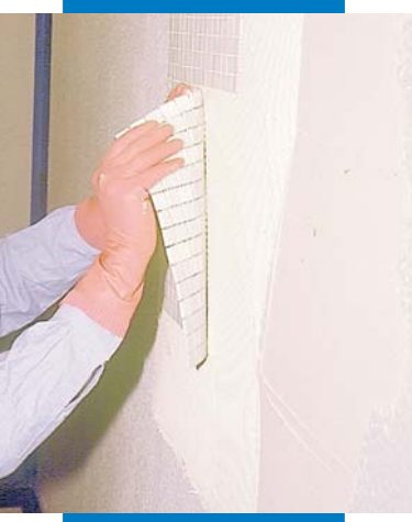
Laying glass mosaic