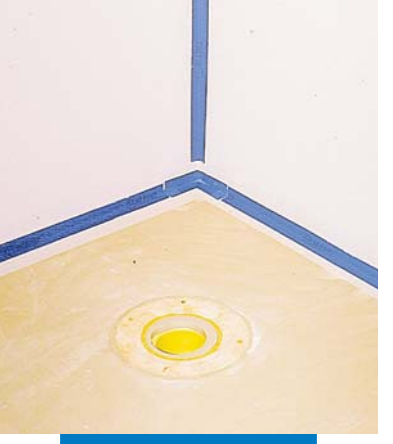
Bathroom wall waterproofed with Mapegum WPS and Mapeband