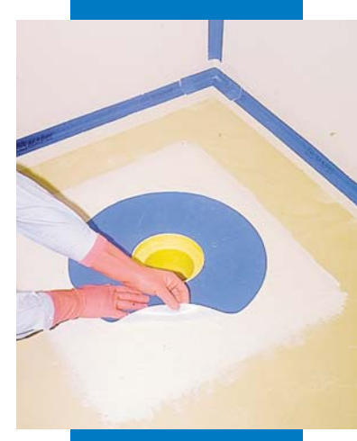
Positioning the special piece of Mapeband over Mapegum WPS

Mapegum WPS is available in 5, 10 and 25 kg drums.