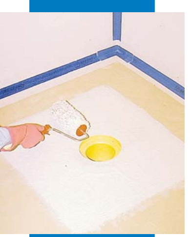
Spreading Mapegum WPS around the drain in a shower cubicle