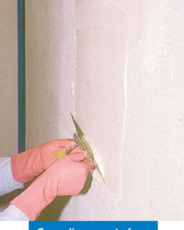
Spreading a coat of adhesive on Mapegum WPS

All relevant references for the product are available upon request and from www.mapei.com