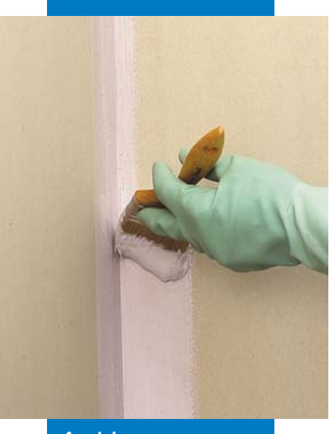
Applying Mapegum WPS with a brush