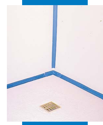
End result of a waterproofing treatment using Mapegum WPS and Mapeband