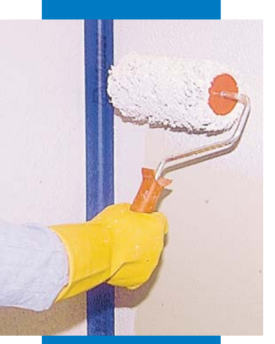
Applying Mapegum WPS on a wall with a roller