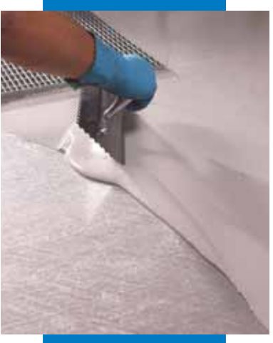
Applying a second layer of Monolastic on Mapetex Sel