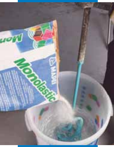
Mixing of Monolastic

Before spreading Monolastic on the surface, special care must be taken around expansion joints and fillet joints between horizontal and vertical surfaces. In the case of structural joints, use Mapeband TPE bonded to the substrate using Adesilex PG4 , covered by another layer of Adesilex PG4 over the fabric with sand sprinkled on the surface to guarantee a good grip of Monolastic . In fillet joints between horizontal and vertical surfaces, apply Mapeband synthetic rubber fabric bonded in place with Monolastic .