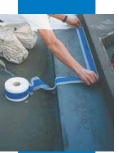
An example of Mapeband waterproofing a corner between the bottom and a side of a bath tub