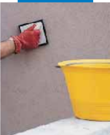
Finishing Mape-Antique FC with a float sponge

cracks caused by plastic shrinkage, alkali-aggregate reaction, and above all, attack by sulphate salts often present in masonry.