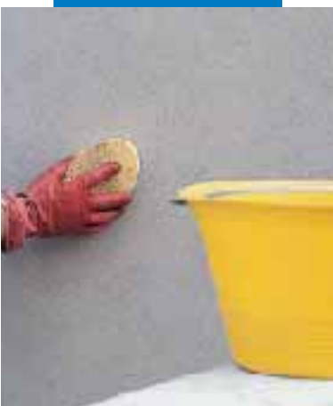
Finishing Mape-Antique FC with a sponge