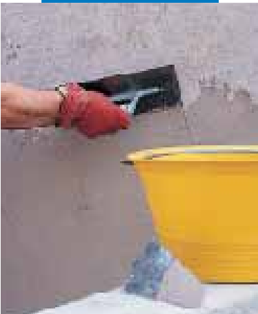
Applying Mape-Antique FC with a trowel